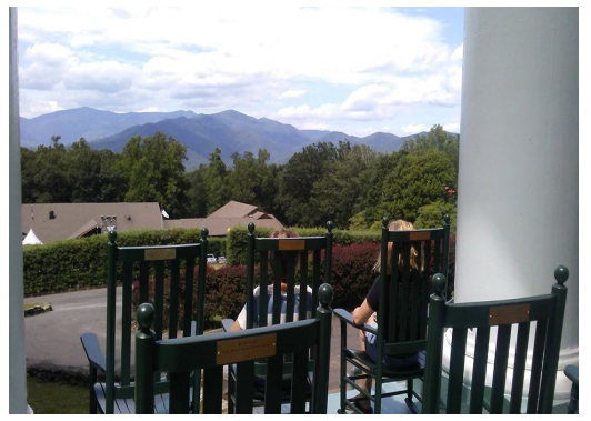
See your FCA Staff for Pricing