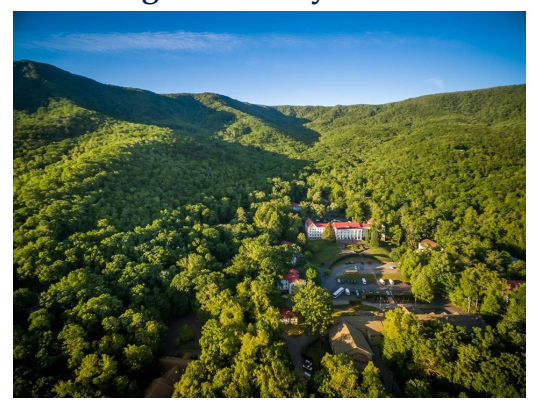
Space in all camps fill up fast!

Escape to the beautiful mountain setting of Black Mountain, NC. Camp is held at the historic YMCA Blue Ridge Assembly.