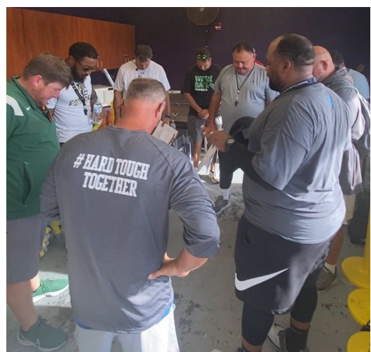
Come spend a week of inspiration and fun with your family & FCA!